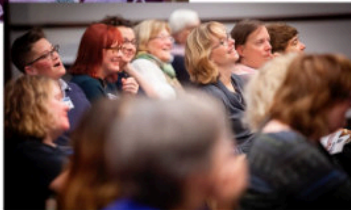
NAWE Social 17:15